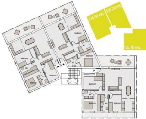
First & Second Floors

2 BEDROOM apartments , 2 bathrooms, store, 21 sqm large terrace, modern kitchen setting, spacious combined/open plan living and dining, store, two parking spaces.